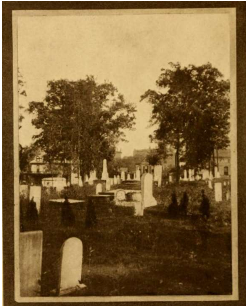
A photograph of Settlers Cemetery from Charlotte in Picture and Prose .