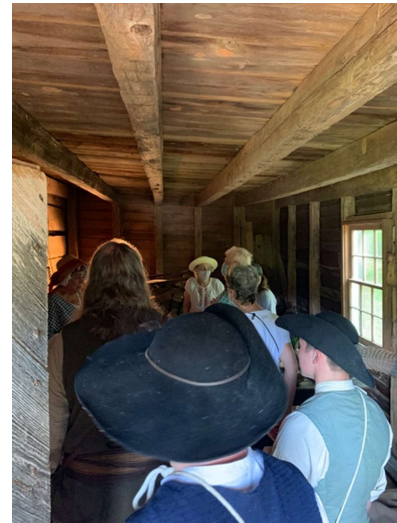
1 st Mecklenburg Militia guests visit the mysterious 1787 addition. Storage, sleeping, tavern, who knows?

Hugh Torance House and Store, which has been closed for almost two years, opened its doors – all its doors – for two days August 21 and 22 as a thank you to those who have helped bring her to the point of reopening.